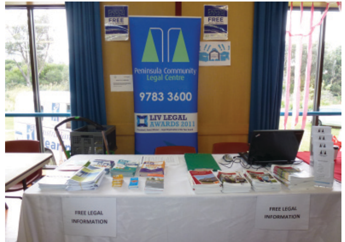
Pictured: Information stall at the Frankston Connect Day

Peninsula CLC values its community connections, and regularly collaborates in public events across its catchment to provide information about the law and raise awareness of free legal services.